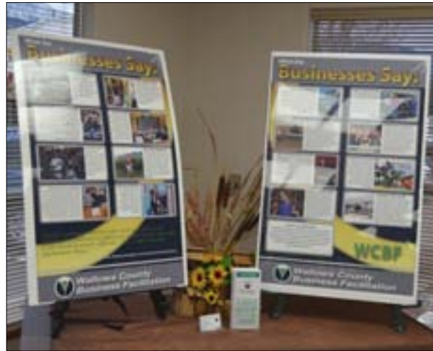
A Local Business and the WCBF is Recognized by the Banks of Wallowa County

ARROWHEAD CHOCOLATES ENTERPRISE COMMUNITY BANK WC BUSINESS FACILITATION WCBF STERLING SAVINGS BANK